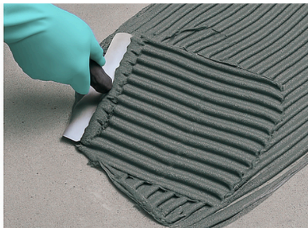
2. Adhesive Application