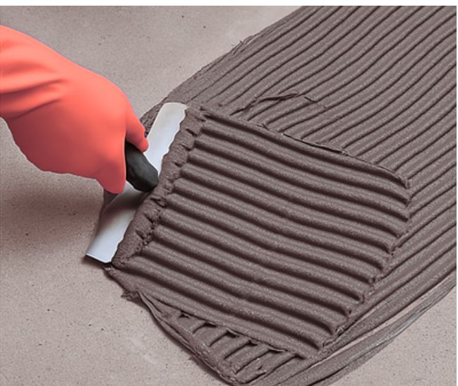
2. Adhesive Application