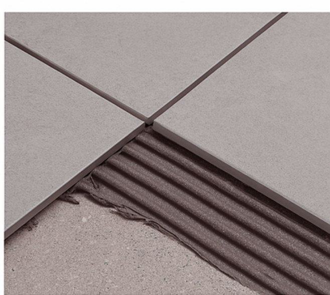
4. Adjustment Time