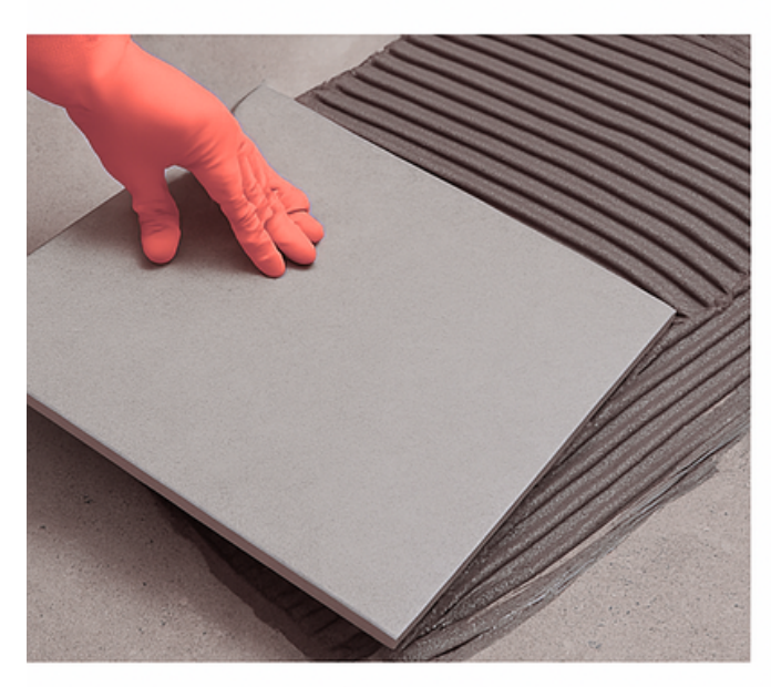
3. Tile Fixing