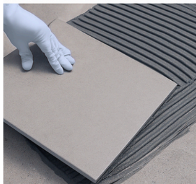
3. Tile Fixing