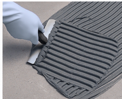
2. Adhesive Application