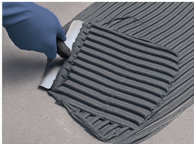
2. Adhesive Application