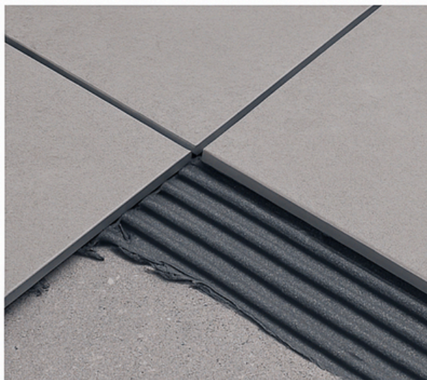
4. Adjustment Time