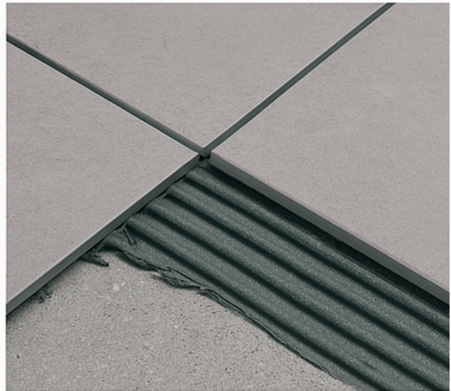
4. Adjustment Time