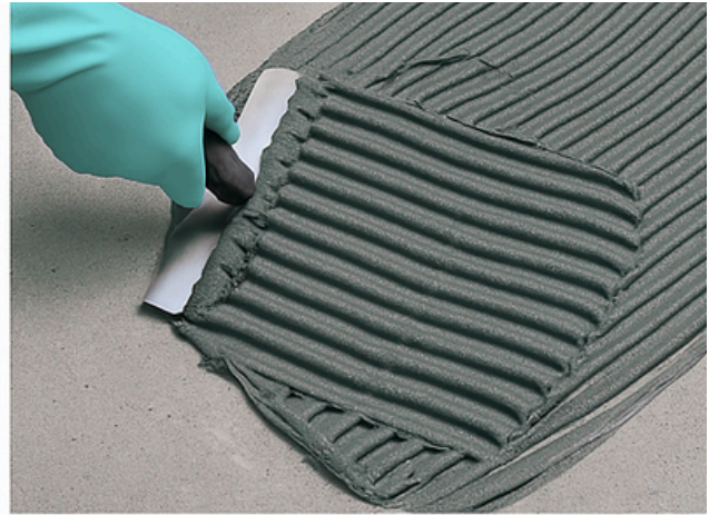
2. Adhesive Application